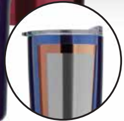
copper plated inner wall

ITEM UPC: 0-47878-80300-5 BK24 UPC: 0-47878-49215-5